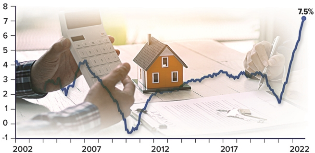
12-month change in shelter costs (CPI-U)