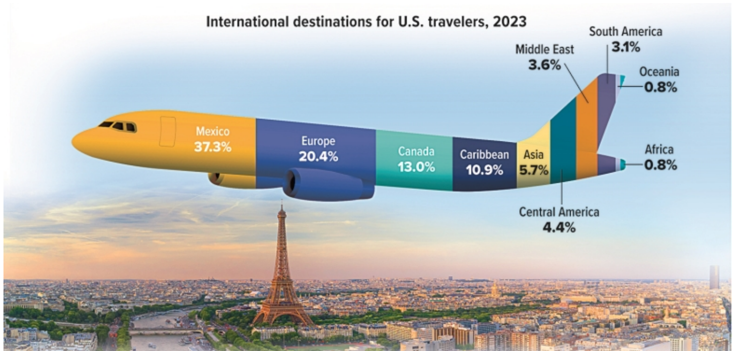
International destinations for U.S. travelers, 2023